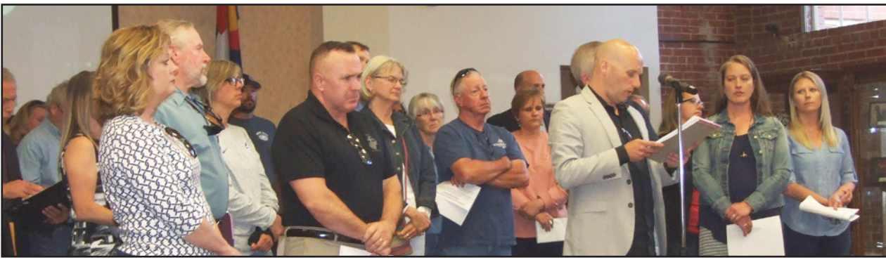
Above: A number of community members spoke at the D38 Board Education meeting June 10 to protest the location of the new Monument Academy facility at the intersection of Highways 105 and 83.

meeting between concerned citizens and the board. He said there are processes to seek community input before such a decision. When the district purchased the property, it was for a small school. There was insufficient notice of the single hearing on the subject, he said.