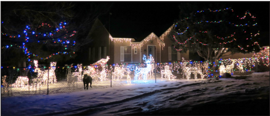
Above: In December, this yard in historic downtown Monument lit up the dark nights with 25 deer decorations... and one real guard dog. Right: These homeowners on East Caribou Drive chose a vintage red truck with a Christmas tree in the back to celebrate the season and cheer up neighbors. Below: One home in Arrowwood III illuminated dozens of Christmas decorations on Dec. 23 including Santa and his sleigh, Rudolph the Red-Nosed Reindeer and the Abominable snowman, Santa driving a railroad train, The Grinch and his dog Max, Olaf the Snowman and Sven the Reindeer from Frozen, and a variety of other snowmen and elves.