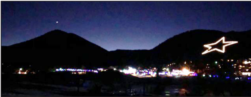
Above: A photo taken Dec. 21 showing the “Christmas Star” conjunction of Jupiter and Saturn and the Palmer Lake star.