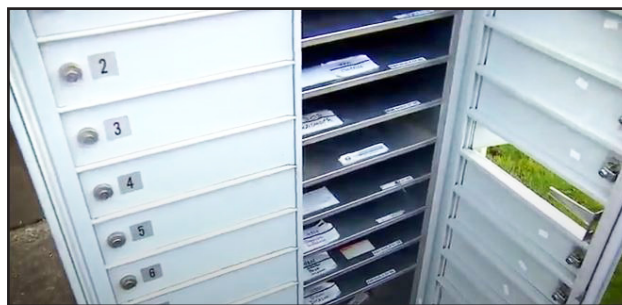
Above: Thieves in El Paso County are breaking into community mailboxes like this one as well as individual mailboxes.

Please check your incoming mail on a daily basis. Do not leave mail sitting in your mailbox overnight. Also, please mail your outgoing mail preferably at a postal annex. We understand this can be an inconvenience, but criminals are stealing whatever mail they can get their hands on, and mailing your items at a