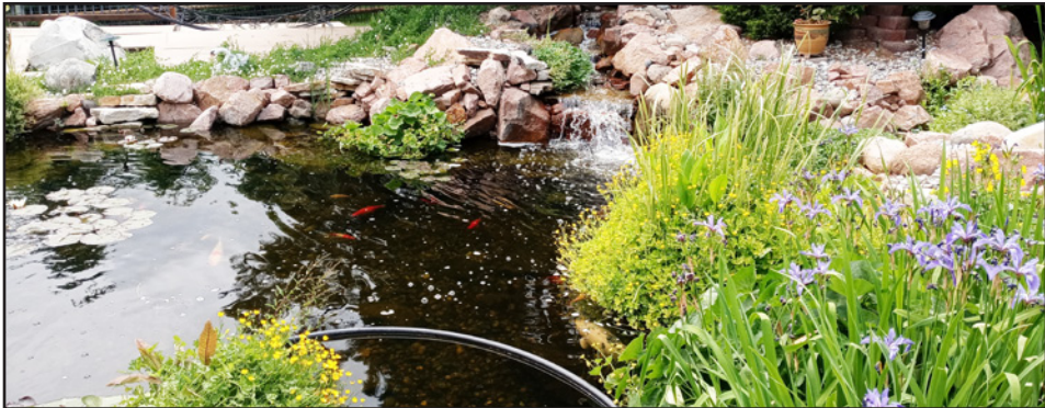
Above: Purely Ponds' annual Parade of Ponds was held June 25-26. Here, the Kershaw Pond in Kings Deer showcases a backyard pond with plant bog and scenic stream, complete with iris, koi fish and water lilies. The self-guided pond and waterfall tour featured 14 landscapes, with proceeds benefiting the Boys and Girls Club of the Pikes Peak region.