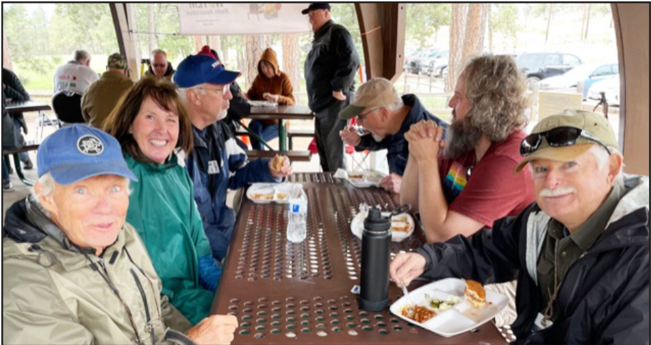
Above: Amateur Radio Relay League (ARRL) Field Day 2022. Every June, more than 40,000 hams throughout North America set up temporary transmitting stations in public places to demonstrate ham radio's science, skill and service to our communities and our nation. It combines public service, emergency preparedness, community outreach, and technical skills all in a single event. Field Day has been an annual event since 1933, and remains the most popular event in ham radio. WØTLM, the Tri-Lakes Monument Amateur Radio Club, held its Field Day event at Black Forest Regional Park on June 25. Get involved by attending one of WØTLM's monthly meetings or weekly on-air nets. There are no dues, no costs, and no obligations—just plenty of learning, support, fun, and community. See WØTLM.com for details.