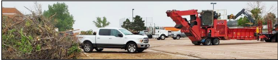
Above: Tri-Lakes residents brought tree limbs and slash to Woodmoor Improvement Association's chipping days on June 25-26 at the south parking lot of Lewis-Palmer High School. A new drop-off system meant there were no lines, and trailers were unloaded quickly, making it easy for everyone to reduce "ladder fuels" on their property. WIA is hosting another set of chipping days July 30-31. Accepting: branches, bushes, logs up to 8 inches in diameter, and pine needles. As in previous years, no construction materials, rock/rubble, stumps, or garbage will be accepted. Only clean slash/logs will be accepted. Please contact the WIA Office with questions at 719-488-2693 x 4. Non-Woodmoor residents are asked to make a donation.