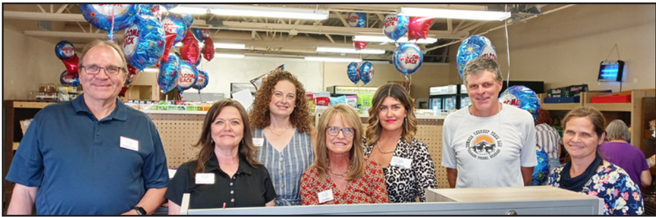
Above: On June 16, Tri-Lakes Cares (TLC) staff welcomed back clients to a newly renovated market. Clients can now go into the building to shop for groceries and meet their case managers and neighborhood nurse. The new hours of operation are Mondays and Thursdays from 11a.m. to 1 p.m. and 4 to 6 p.m. No appointments are needed to receive groceries during these walk-in hours. The mission statement for TLC is "a community-based, volunteers-supported resource center whose purpose is to improve people's lives through emergency, self-sufficiency, and relief programs." This is the first time since the pandemic started in March 2020 that TLC has reopened its doors to the public at 235 N. Jefferson St. in Monument.