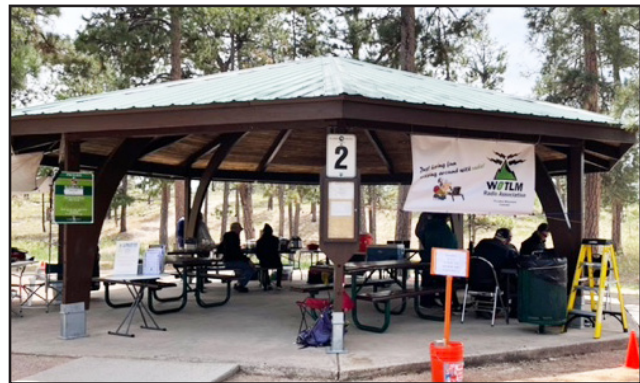
Left: Pavilion at Black Forest Regional Park.