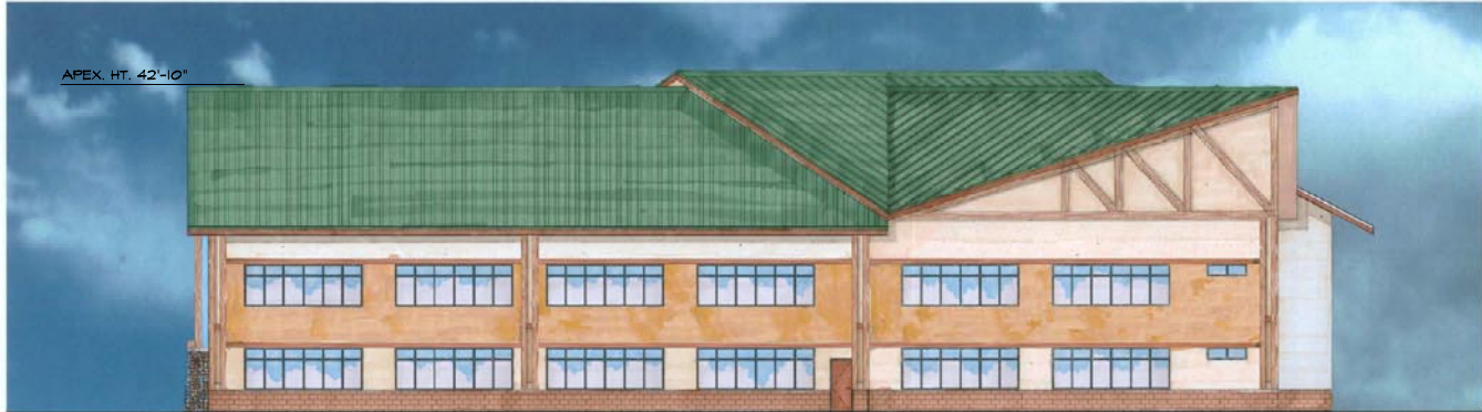
TYPICAL REAR ELEVATION

NOTE: FOR MATERIALS SPECIFICATIONS REFER TO LAND USE, DEVELOPMENT STANDARDS ARCHITECTURAL CONTROL DOCUMENT.