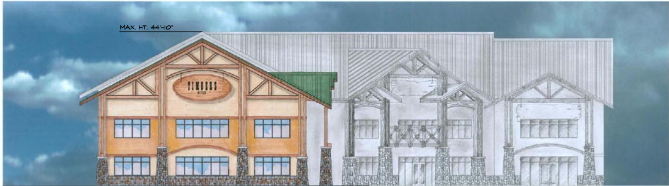
TYPICAL SIDE ELEVATION