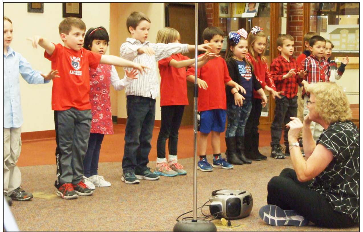
Above: First-graders from Kilmer Elementary signed the lyrics to God Bless America at the November board meeting.