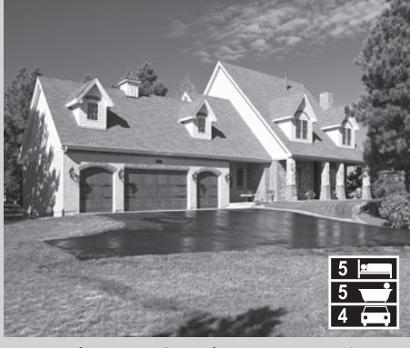
Elegant 2.7 Acre Estate!

Gotta see! True MAINTENANCE-FREE rancher in Monument, with fenced yard, laundry on the main and airy, open floor plan close to shopping and trails.