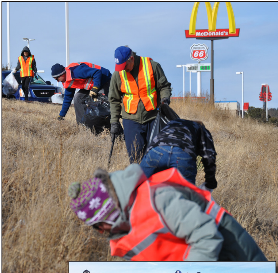
Above — The Random Acts of Kindness (RAK) community service group "took to the hills" on Jan. 17 and worked three community service projects. One was a Palmer Lake-area leaf cleanup

Print Run: 18,200 Mail Delivery: 17,511 Stacks: 689