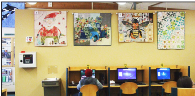
Above: Works by the Palmer Divide Quiltmakers will be featured in the library during March.