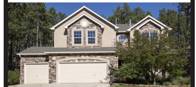
1043 Longspur Lane, Colorado Springs, CO 80921

Splendid inside/outside living in a great location in Cordera on a big lot! 5,052 sq. ft. 5 bd, 4 ba. Designer touches everywhere with attention to design and detail! Gourmet kitchen with island, two sinks, stainless steel appliances, gas cooktop, granite counters and eating nook with walkout to a deck showcasing amazing views of Pikes Peak. Kitchen and breakfast bar opens to fantastic great room with fireplace! Year-round front patio with fireplace, room for seating and privacy wall with gate. Study or second main-level bedroom with fireplace, beams, and walk-in closet. Sumptuous master suite with two-sided fireplace and television overhead. Fireplace and television in master bathroom for soaking luxury. Large master walk-in closet with door to laundry. Formal dining room with beautiful built-in wall of cabinetry and counter. Awesome wet bar downstairs—great for those big parties! Decked out theater room with reclining theater seating that stays with the home. Could not be built again for the price! Entire main level has surround sound, including the outside living spaces. $850,000