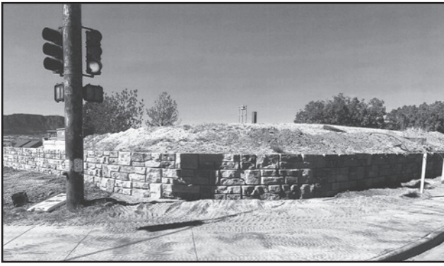
Above: Another significant project completed by the Parks and Open Space crews of Triview Metropolitan District is the retaining wall at the northwest corner of the Baptist Road and Leather Chaps Drive intersection.