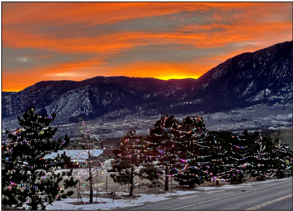
Above: While returning home on Jan. 2 after walking in the Greenland Open Space, I could tell the sunset was going to be good. When I got off I-25 in Monument, the sunset was great. I pulled over on Second Street just west of Highway 105 to hurriedly capture the sunset on my phone with the Christmas lights in the foreground.