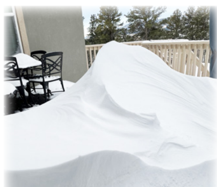
Wild weather - see pages 24 and 27