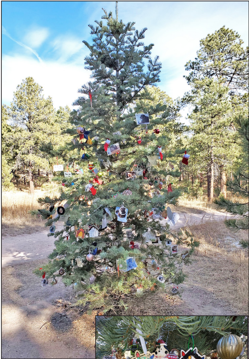
Above: People continued using the Fox Run Park Holiday Pet Memorial Tree this year as a way of celebrating the lives of pets. The tradition of placing ornaments on the tree started in 2007 in memory of Daisy Mae, a golden retriever. Daisy Mae enjoyed the park and in particular the area in vicinity of the tree at the junction of two trails. Since then, the number of ornaments placed on the tree has grown. There are requirements and restrictions for placing an ornament. The ornaments must be between 2-by-2 inches and 4-by-4 inches and may be made of metal, wood, pewter, plastic, or cardboard. The ornaments cannot be made of glass or food, among other noted restrictions. They may be placed on the tree after Thanksgiving and are removed by volunteers by Jan. 2.