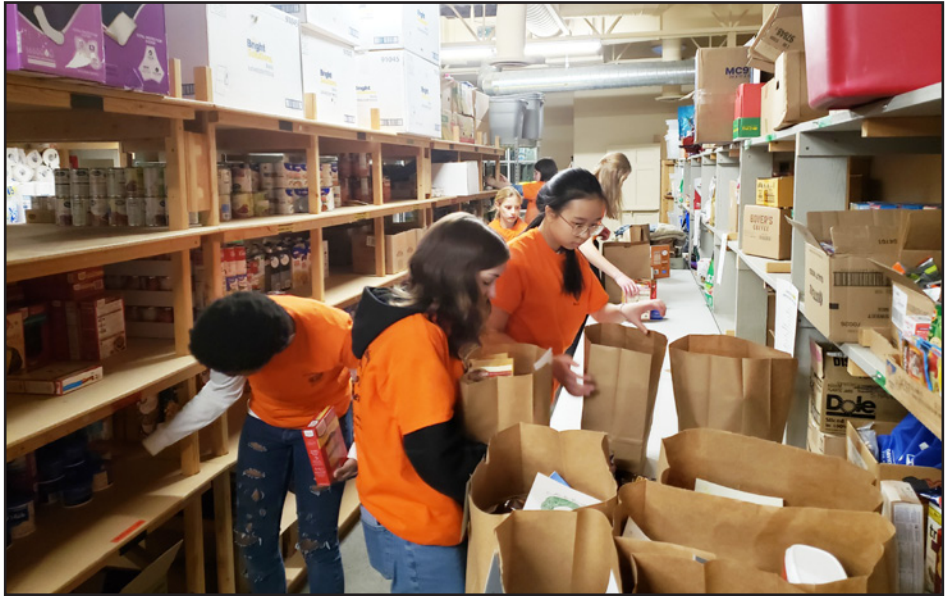
Above: Volunteers of the Lewis-Palmer High School Key Club organize and assemble non-perishable items for Tri-Lakes Cares (TLC) food sacks. On Dec. 15, they prepared enough to provide for the needs of many Tri-Lakes area families and individuals. On Dec. 18, the TLC Christmas distribution for these households included toys and perishable food items. The annual Harvest of Love food drive in September and October fortifies TLC with many of these food items, which are donated and collected at schools throughout Lewis-Palmer School District 38. This year, Harvest of Love collected 17,256 pounds of non-perishable food along with $10,129 in cash for TLC. Lewis-Palmer and Palmer Ridge High School Key Clubs provide hundreds of hours of volunteer community service to the Tri-Lakes area every year. Caption by Sharon Williams.