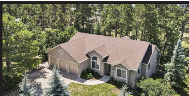
Stylish Woodmoor Walkout, Monument - 5 bd, 3 ba, 3 car, 3,782 sq. ft. 0.6 ac.

A rare opportunity to own a home in these exclusive communities! Call for more information or a private showing.