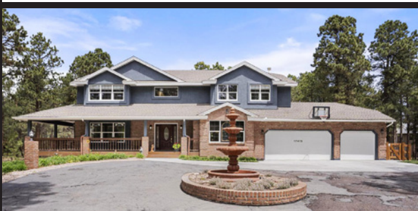
Elegant Bent Tree Beauty, Monument - 5 bd, 4 ba, 3 car, 5,332 sq. ft. 2.5 ac.