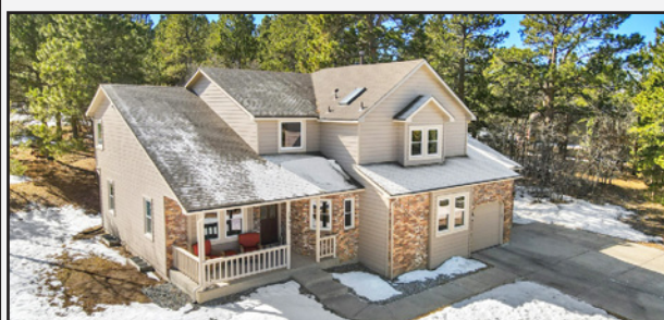
1355 Lone Scout Lookout , 4 Bed/4 Bath/4329 Sq. Ft. Listed at $800,000. MLS #9247254