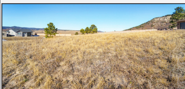
Three Home Sites Available , 1404, 1432, 1446 Piney Hill Pt. Luxury Patio Home Community. Offered at $100,000 each. Call for details!