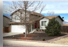
WOODLAND HILLS Sold 3/23 $425,000