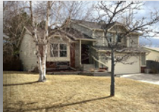
BRIARGATE u/c $460,000