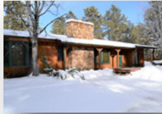
BLACK FOREST Sold 2/23 $685,000