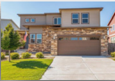
THORNTON Sold 2/23 $684,900