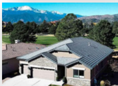
KISSING CAMELS Sold 3/23 $1,075,000

Available Home Inventory is still Low and Interest Rates have steadied/declined, while demand remains Very High! Call me for a FREE, home value analysis!