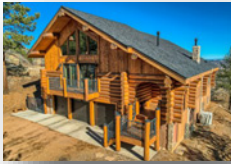
UPPER SKYWAY u/c $1,195,000

ter to the BOCC's attention in early 2022 when she raised concerns about the method by which it was being treated. At the time, the county had signed a contract for $42,600 to have the affected trees