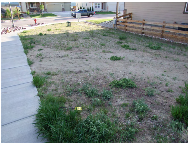
Above: Residents are complaining about the neglected greenbelt near Kitchener Way and Chesapeake Avenue.