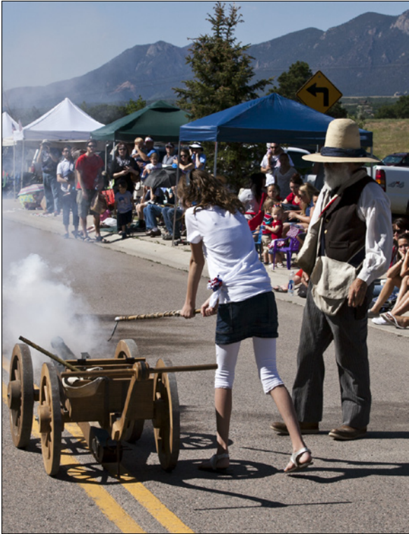
Above: Colorado Springs Musket Loaders have parade watchers fire off a cannon during the Fourth of July parade in Monument. The event once again drew thousands to the Tri-Lakes area for a variety of activities throughout the day. The day started with a Fun Run from Palmer Lake to Monument, followed by the St. Peter Pancake Breakfast. Next, children decorated their bikes, other types of transportation, and themselves for a festive Children's Parade. The main parade followed with marching bands, cheerleaders, horse riders, fire trucks, and oaks decorated in a variety of patriotic and other ways. Following the parades, attendees browsed through a street fair, watched bull riding, and listened to music in Limbach Park to conclude the day.