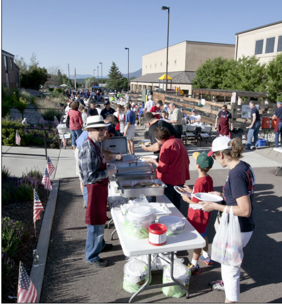
Above Right: Attendees of the pancake breakfast lined up for pancakes, eggs and sausages on the morning of July 4. The St. Peter Knights of Columbus hosted the annual pancake breakfast. Military personnel and first responders received their breakfasts for free.