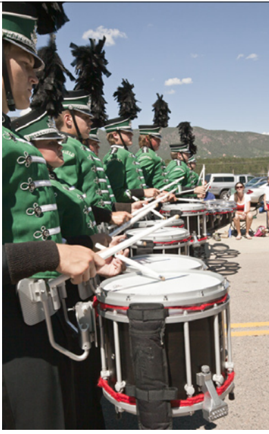
Right: Litchfield Marching Band of Litchfield, Minn.