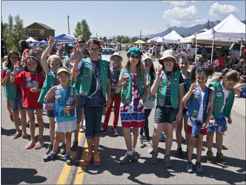
Above Left: Local Girl Scout Troops were represented in the Parade