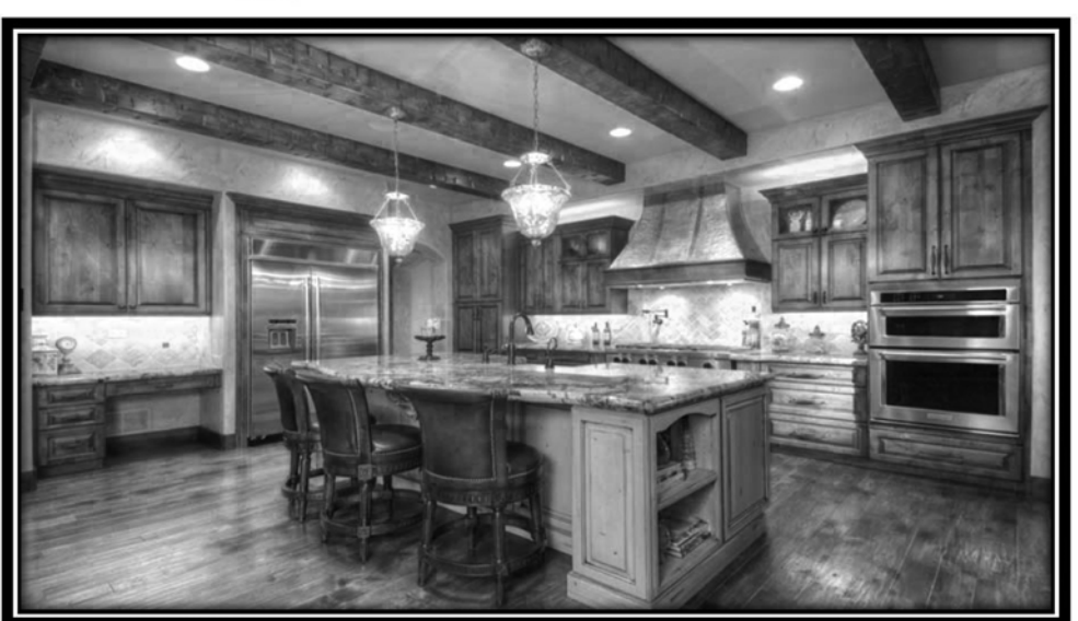
2015 Parade of Homes 'People's Choice' Award Winner

There's Still Time to Get Your Home Holiday Ready!