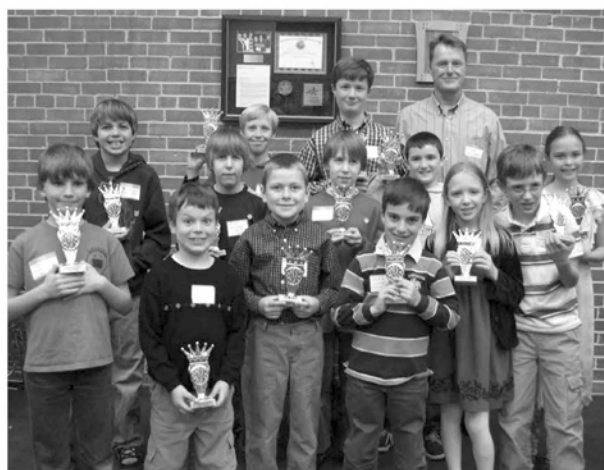
Tournament competitors are awarded trophies and ribbons for their chess accomplishments.