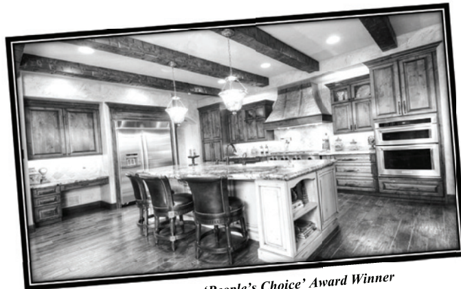
2015 Parade of Homes 'People's Choice' Award Winner