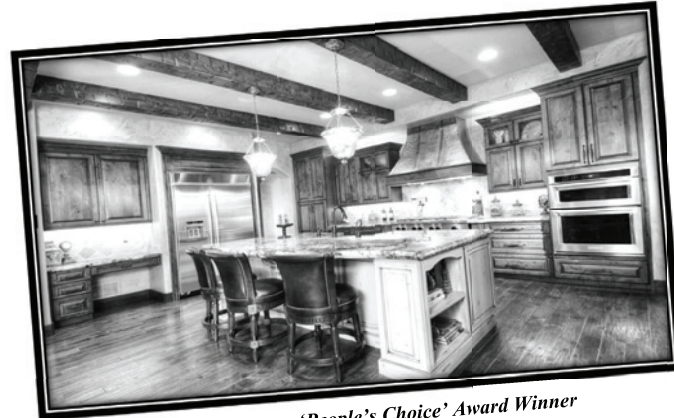
2015 Parade of Homes 'People's Choice' Award Winner

The Top Kitchen Designers in Southern Colorado Right Here in Monument!