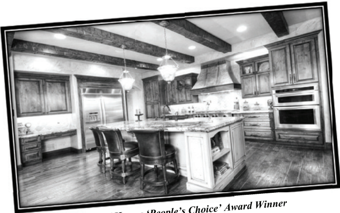
2015 Parade of Homes 'People's Choice' Award Winner

The Top Kitchen Designers in Southern Colorado Right Here in Monument!