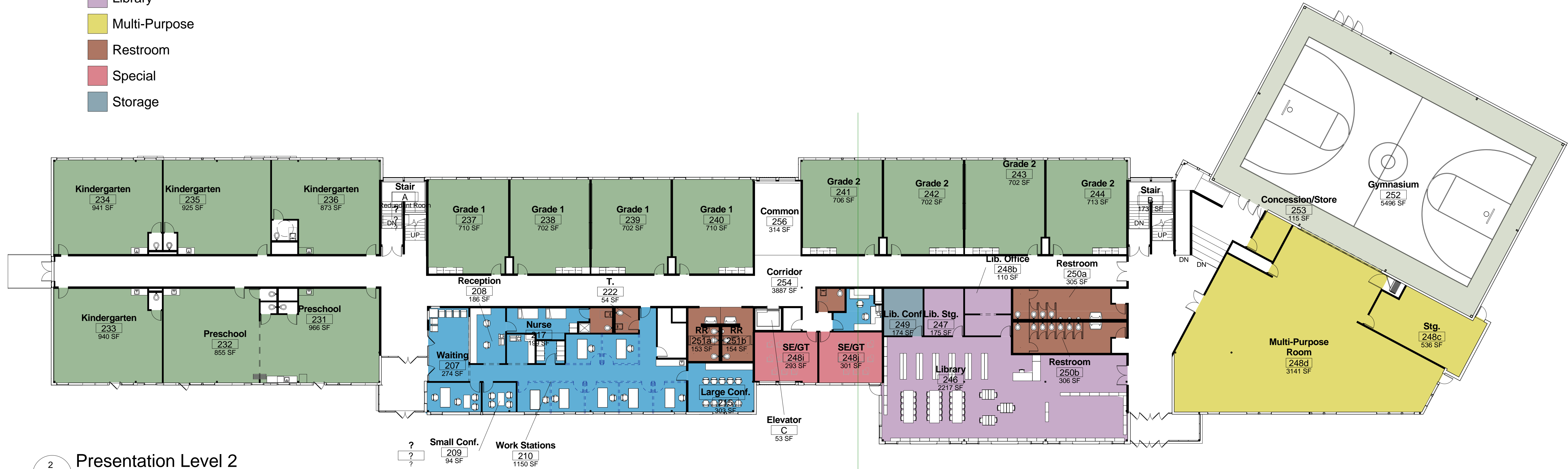
2 Presentation Level 2 1-A 1/16" = 1'-0"