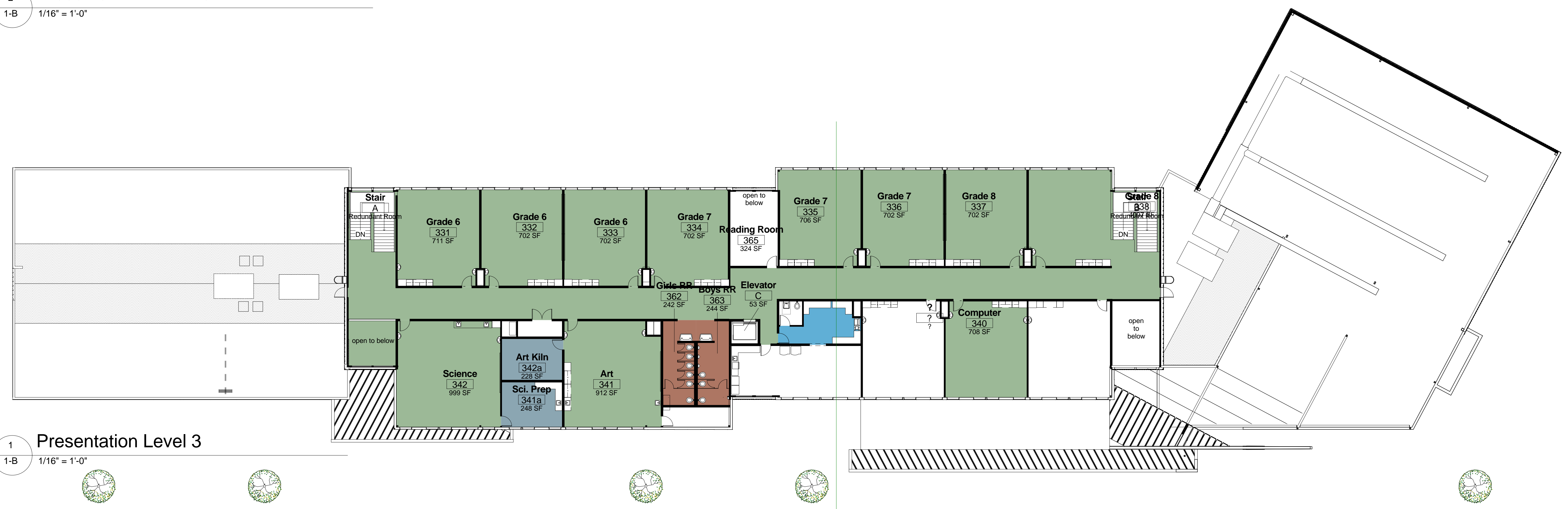
1 Presentation Level 3 1-B 1/16" = 1'-0"